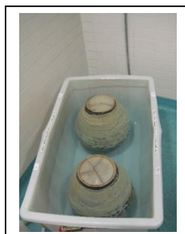
Removing the Salt deposits