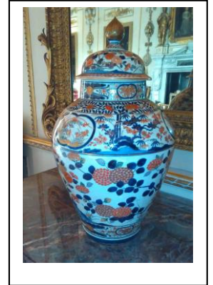
One of the vases before treatment